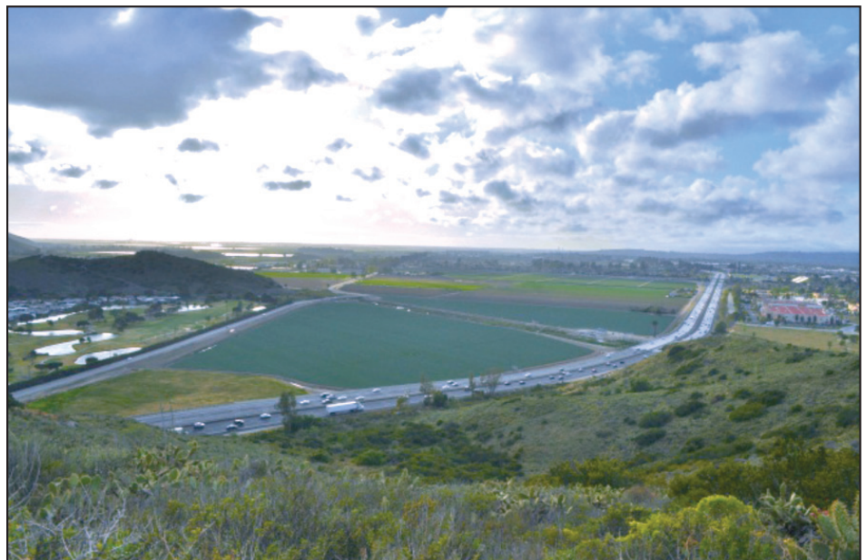
Camarillo Sustainable Growth shines light on the proposed Conejo Creek Properties project that would eliminate 740 acres of prime farmland and floodplain at the base of the Conejo Grade.