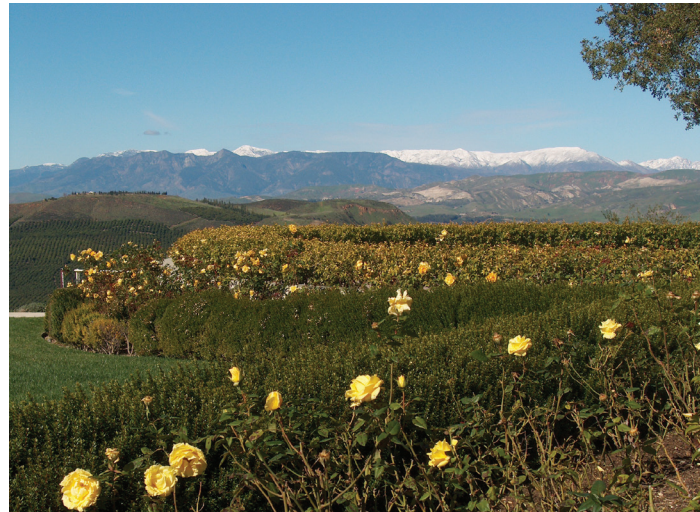
Reagan Library greenbelt purchase protects important wildlife corridor as well as views.

All's well that ends well: what once was the Cornerstone Church's proposal to fill in five solid acres of open space-zoned land with buildings and enough parking to serve the Ventura County Fair grounds, has now become a scenic preserve for the Ronald Reagan Presidential Library.