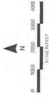
Currently Proposed Land Use Map